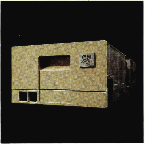
9455 Lark Module Drive