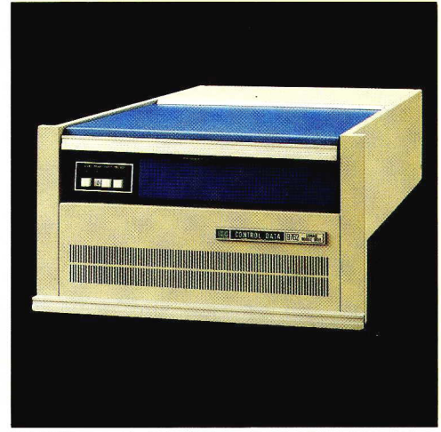
9762 Storage Module Drive

Control Data builds performance and reliability into its rotating memory because we design, develop and manufacture the three critical disk drive components — heads, media and servo.