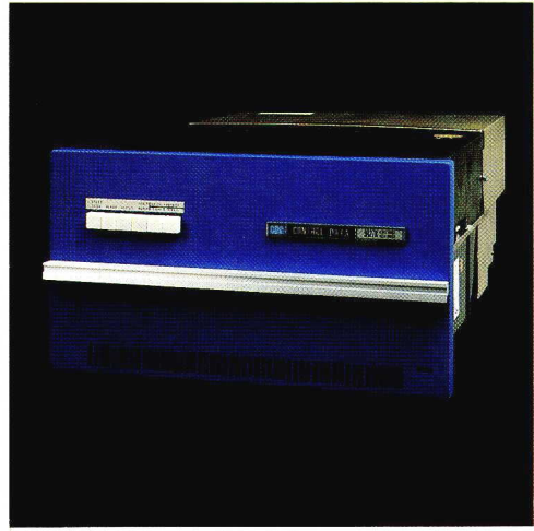
9427H Cartridge Interface Drive